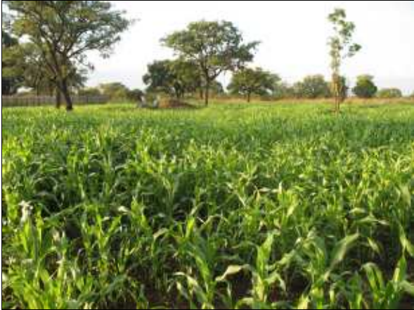
Maize growing just outside the Bori farm compound

While on my fund-raising trip throughout Alberta and south-eastern BC, God provided an All Terrain Vehicle which will be used by our new General Manager, as well as more than a dozen chain saws which will be most useful in the land-clearing and charcoal making we do with the trees. In Lethbridge a farmer gave us a big (big for Sudan) tractor which we will sell here in Canada and use the money for buying a tractor a little more suited to Sudan and the needs on our farms. Also a gift of $7,000 was given for building a church for the farm area.